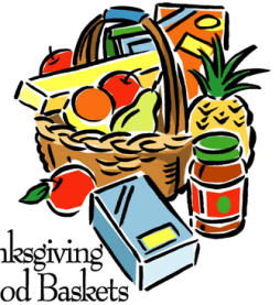
Thanksgiving Food Baskets

Second Collection for Saturday, November 5 and Sunday, November 6 will be for the Archdiocese for Military Services to provide the Catholic Church's full range of pastoral ministries and spiritual services to those in the U.S. Armed Forces.