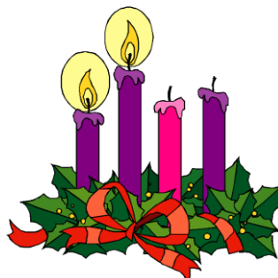
Candle of Peace!

It's where your ability to buy a Christmass Gift comes from. Unfortunately, not all adults understand that, but you can teach your kids that whining does not end in money; work does.