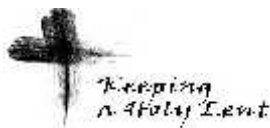
This Photo by Un-

U.S. Catholic's Weekly Reflections for Lent - http://www.uscatholic.org/articles/201403/weekly-reflections-lent-