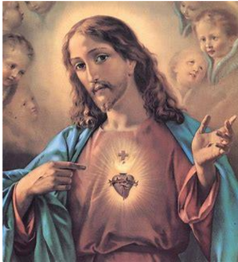
Señor Jesucristo, Hijo de Dios, ten piedad de mí, un pecador.