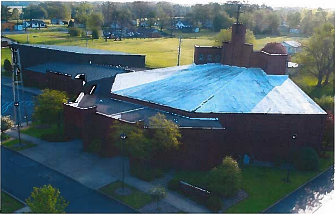
Aged membrane roof (white) and flat roof over narthex.