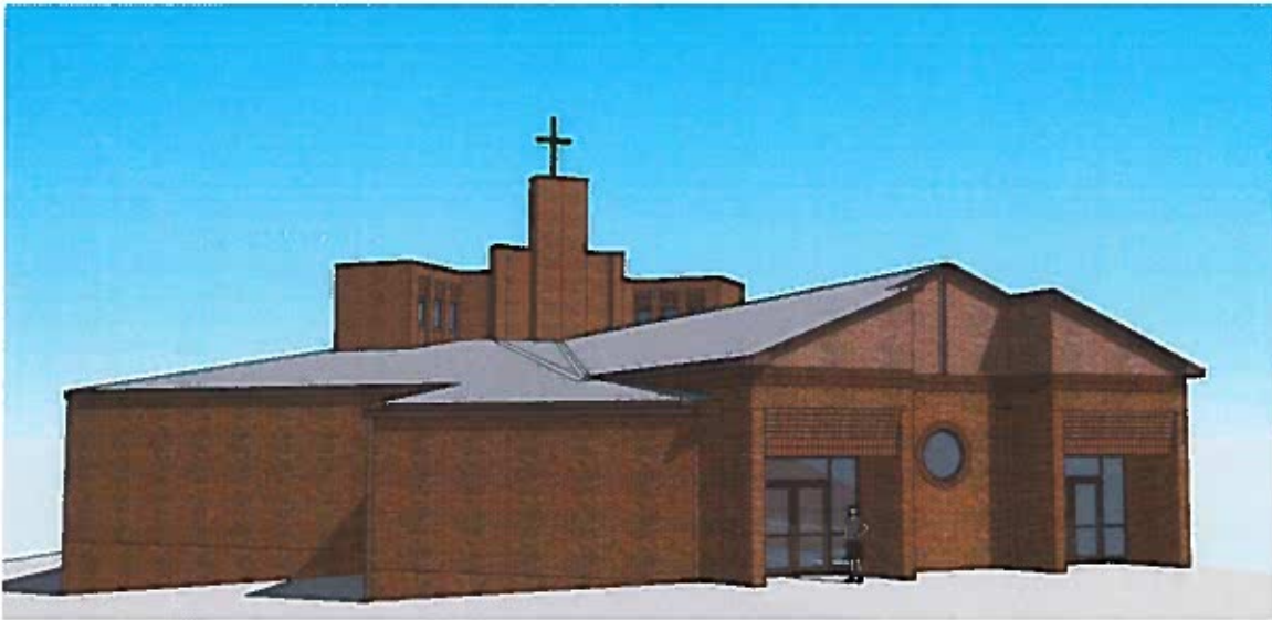
Our future church with new roof and window!