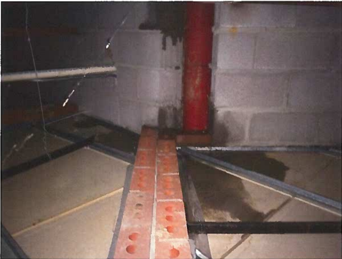
One of many leaks in narthex roof