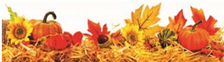
NOTRE DAME - SKOWHEGAN

Wreaths will be labeled and available for pick up at NDdL Rectory Garage, Saturday, November 17 th .