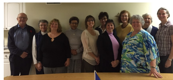
September CWL Meeting