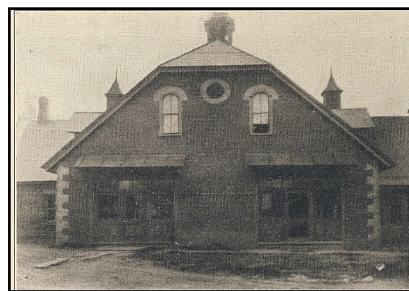
First St. Paul's Home