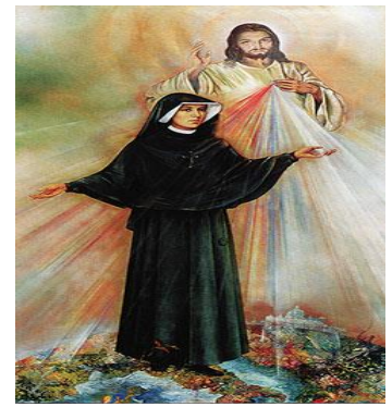
Jesus speaking to St. Faustina.

The Land purchase closing date is Oct 25, 2017. The land has no remedial work.