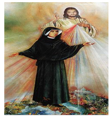
Jesus speaking to St. Faustina.

For more information on events please visit Friday Facts: At the Archdiocese of Ottawa page. www.CatholicOttawa.ca