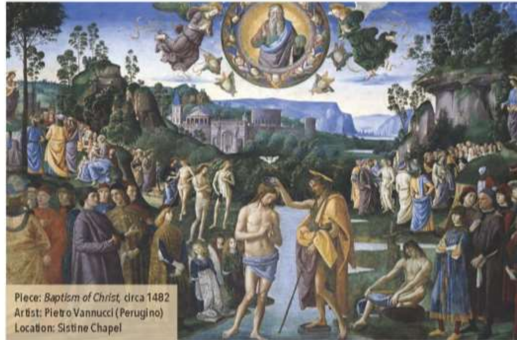
Piece: Baptism of Christ , circa 1482 Artist: Pietro Vannucci (Perugino) Location: Sistine Chapel

This fresco by Perugino, Michelangelo's art teacher, is found on the wall of the Sistine Chapel. Like the other frescoes in this sacred space, this panel contains multiple scenes. The central scene is the baptism of Jesus. The viewer clearly sees Jesus standing in the water, with John the Baptist next to him, pouring water over his head.