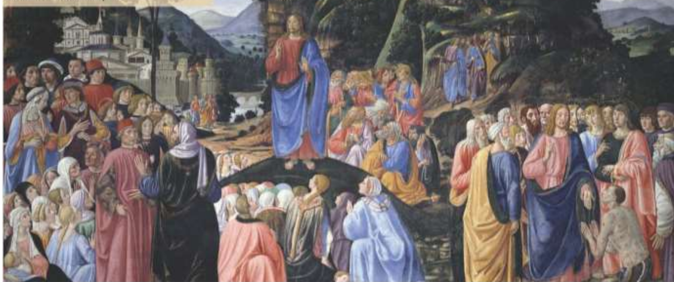
Piece: The Sermon on the Mount , circa 1482 Artist: Cosimo Rosselli Location: Sistine Chapel

"Blessed are they who are persecuted for the sake of righteousness" (Matthew 5:10).