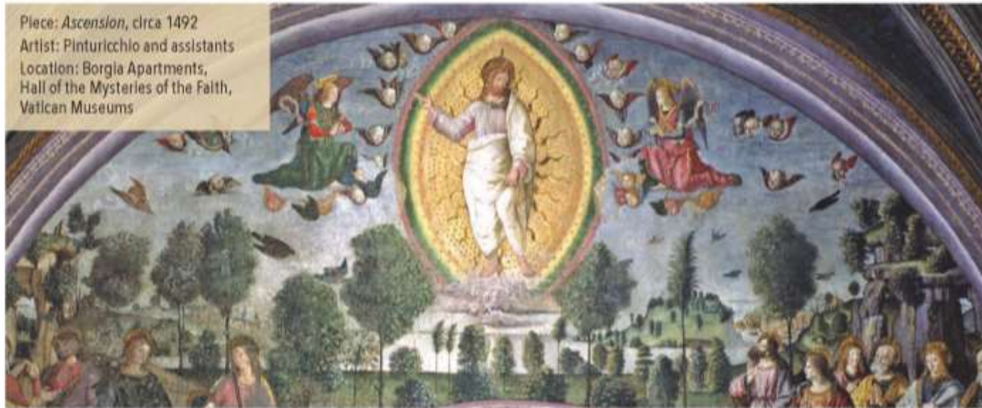
Piece: Ascension , circa 1492 Artist: Pinturicchio and assistants Location: Borgia Apartments, Hall of the Mysteries of the Faith, Vatican Museums

May 28, 2017 Seventh Sunday of Easter (A)/ Ascension of the Lord Seventh Sunday: Acts 1:12-14, 1 Pt 4:13-16, Jn 17:1-11a Ascension: Acts 1:1-11, Eph 1:17-23, Mt 28:16-20