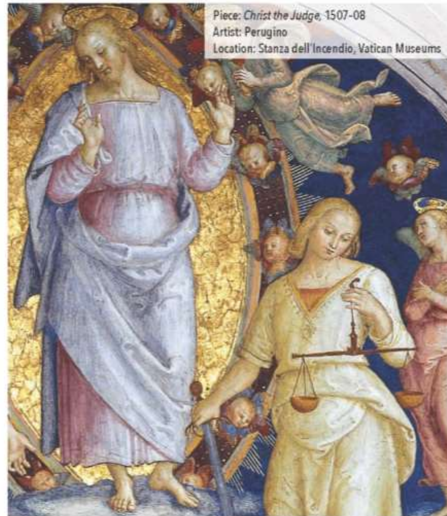
Piece: Christ the Judge , 1507-08 Artist: Perugino Location: Stanza dell'Incendio, Vatican Museums

Remember, as Jesus said: "The measure with which you measure will be measured out to you" (Matthew