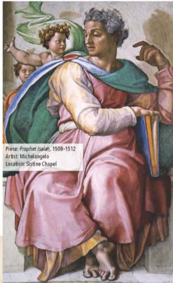
Piece: Prophet Isaiah, 1508-1512 Artist: Michelangelo Location: Sistine Chapel