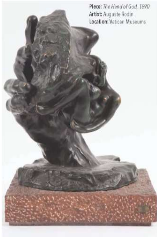
Piece: The Hand of God , 1890 Artist: Auguste Rodin Location: Vatican Museums