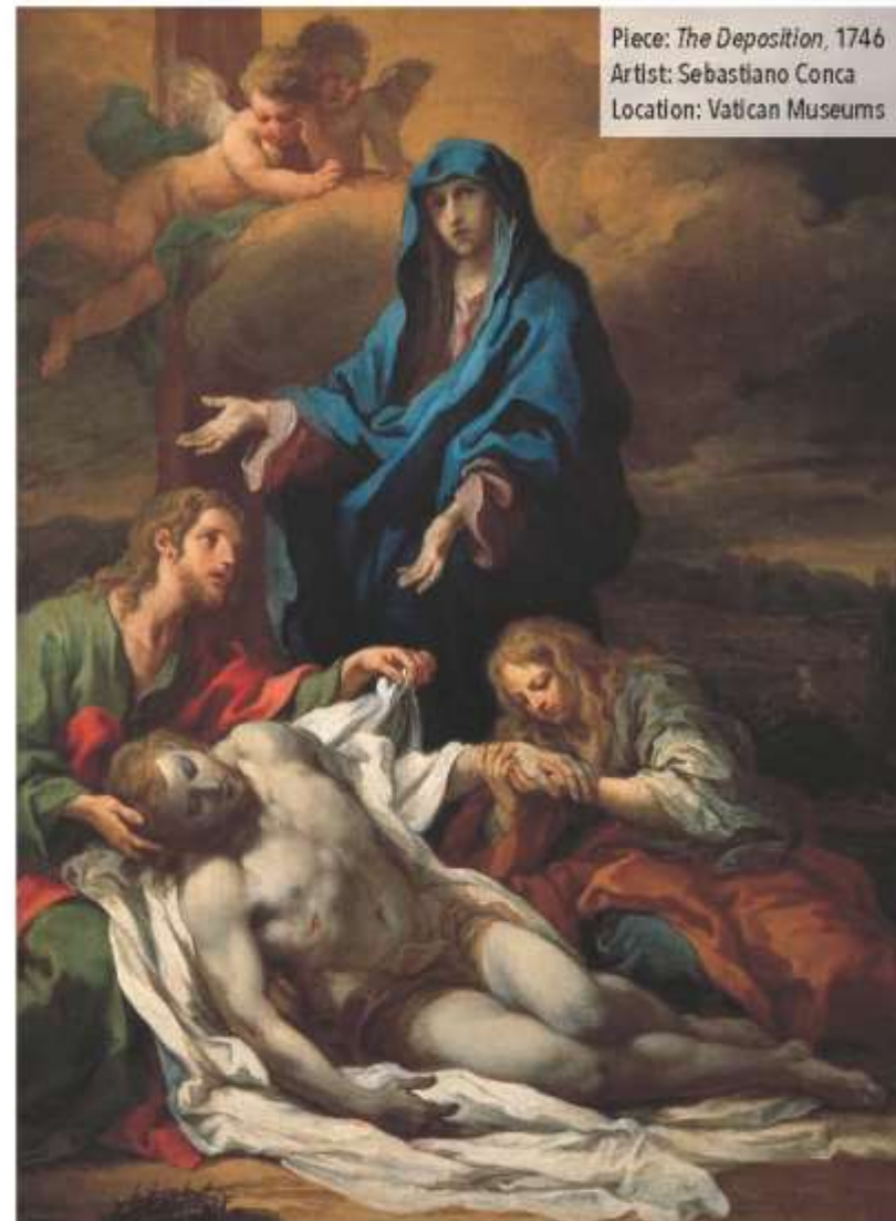
Piece: The Deposition , 1746 Artist: Sebastiano Conca Location: Vatican Museums