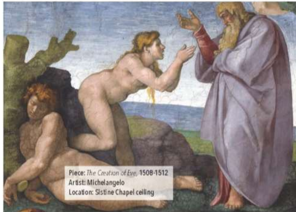
Piece: The Creation of Eve , 1508-1512 Artist: Michelangelo Location: Sistine Chapel ceiling

Do I celebrate all the good things my spouse or loved ones offer me? Do I thank them?