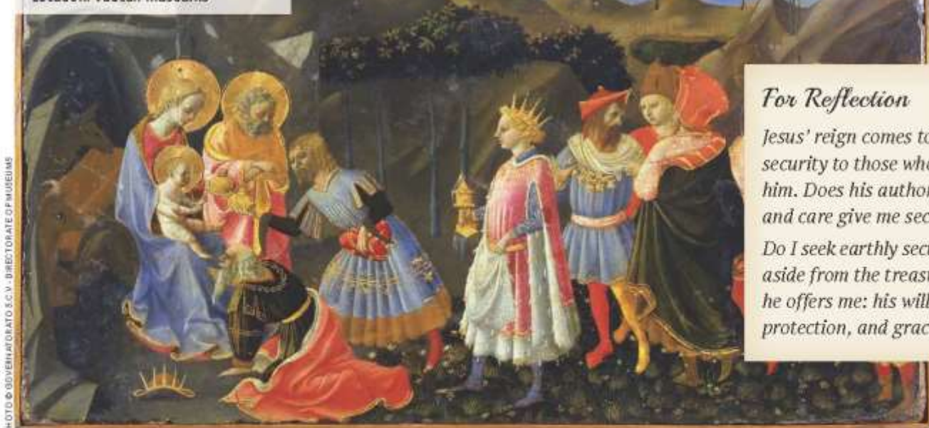
Piece: Adoration of the Kings, 1450s Artist: Pseudo Domenico di Michelino Location: Vatican Museums