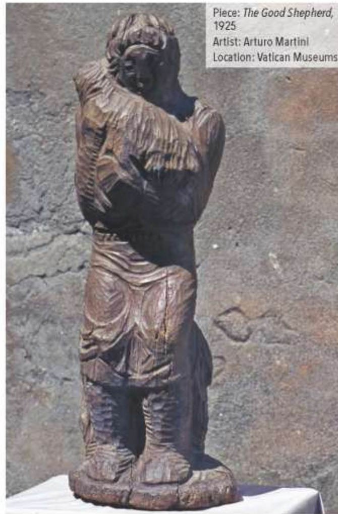
Piece: The Good Shepherd , 1925 Artist: Arturo Martini Location: Vatican Museums