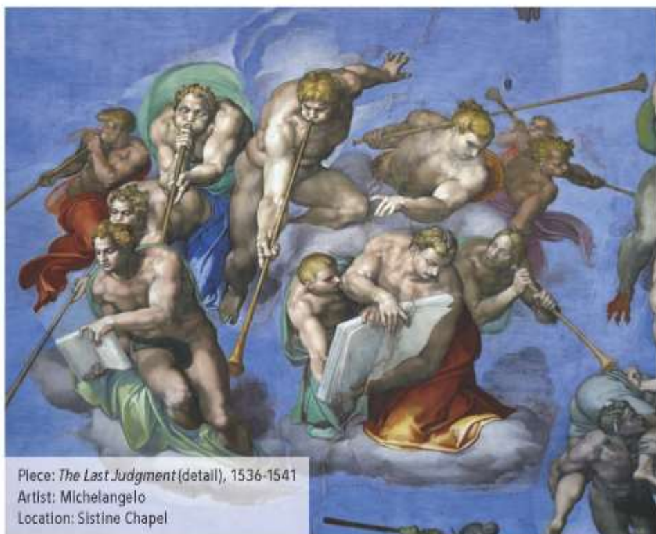
Piece: The Last Judgment (detail), 1536-1541 Artist: Michelangelo Location: Sistine Chapel

The glory of this kingdom isn't in church buildings or organizations, but it's the glory that Jesus mentions in today's Gospel. "Now is the Son of Man glorified, and God is glorified in him" (John 13:31). It's the glory that comes from Jesus' faithful love toward the Father and his disciples, leading him to be enthroned on the cross and rule as the Lamb that was slain yet still