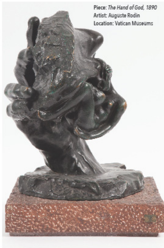
Piece: The Hand of God , 1890 Artist: Auguste Rodin Location: Vatican Museums

The Old Testament offers amazing tips on the