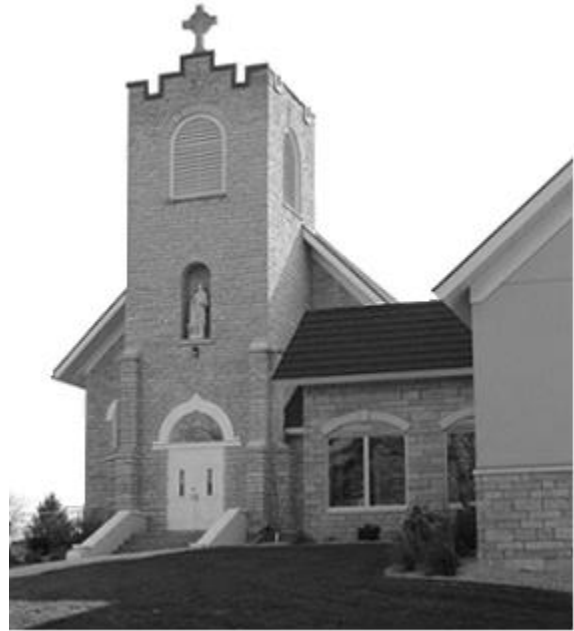
St. Bridget 2123 County Rd 16 SE Rochester, MN