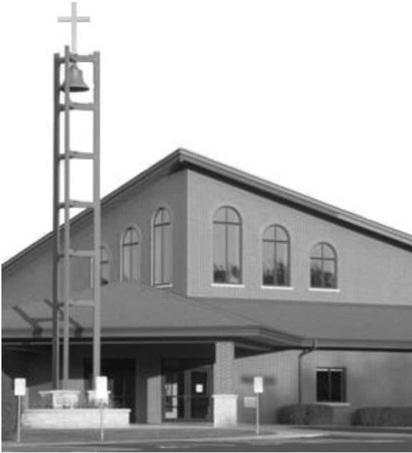
St. Bernard 116 4 th Ave SE Stewartville, MN