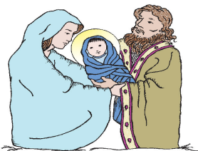
Nativity of the Blessed Virgin Mary