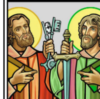
SS. PETER AND PAUL