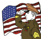
Veterans Day

THANK YOU to all Veterans who have sacrificed and served our Country in the name of freedom and democracy.