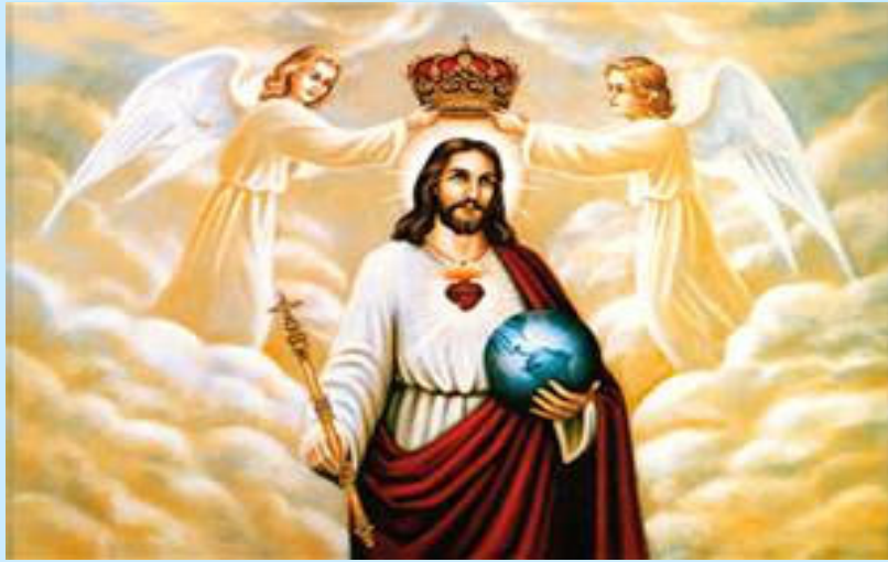
The Lord is King; he is robed in majesty. (Psalm 93) El Señor reina, vestido de majestad. (Salmo 93)

"A welcoming community, committed to fostering a deeper love of Jesus through faith, family, and service to others." Archdiocese of Galveston - Houston Established 1978 November 25, 2018 Our Lord Jesus Christ, King of the Universe