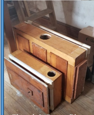
Chapel & Organ Photos