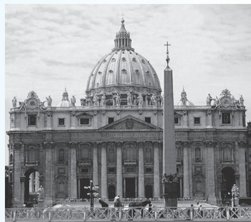
St Peter Basilica