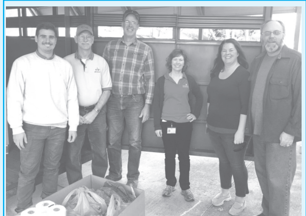
Thank you to Copeland for their food and monetary donations to the St. Mary Food Pantry.

Items always needed for the pantry are: cereal, pork and beans, canned fruit and canned soup.