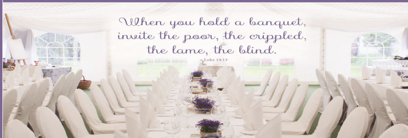
Copyright © J. S. Pataki Co., Inc. Excerpt from the Lectionary for Mass © 2001, 1998, 1997, 1996, 1995, C.C.D.