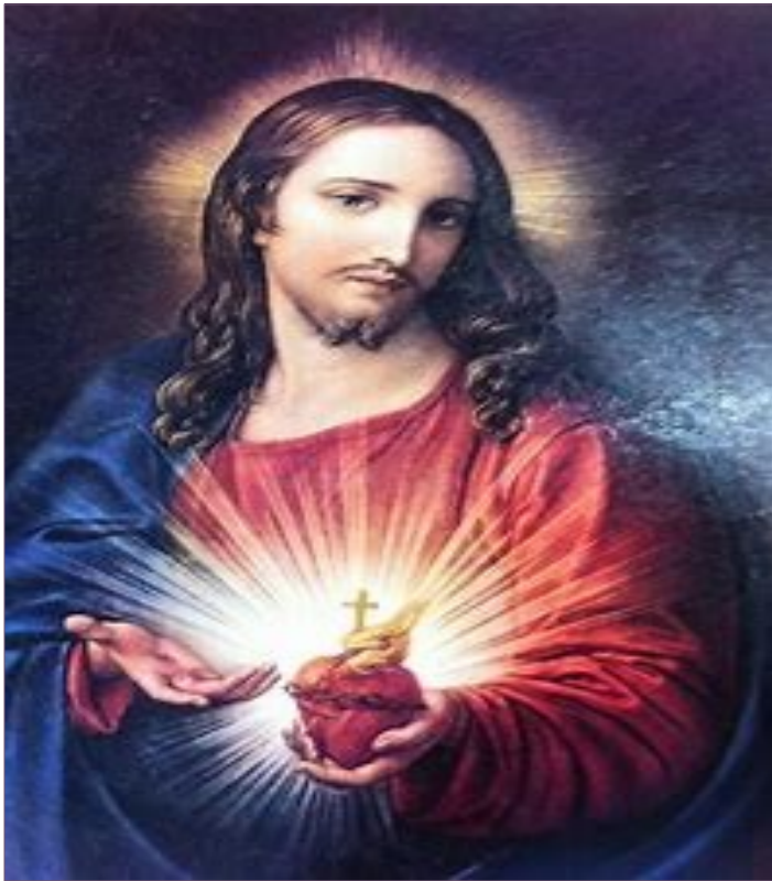
With all my Heart, I Love You... "Do you love me?" ... "Follow me." Jn 21:17;19

Fifth Sunday in Ordinary Time February 10, 2019