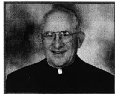
Partially funded by the Bishop's Appeal.