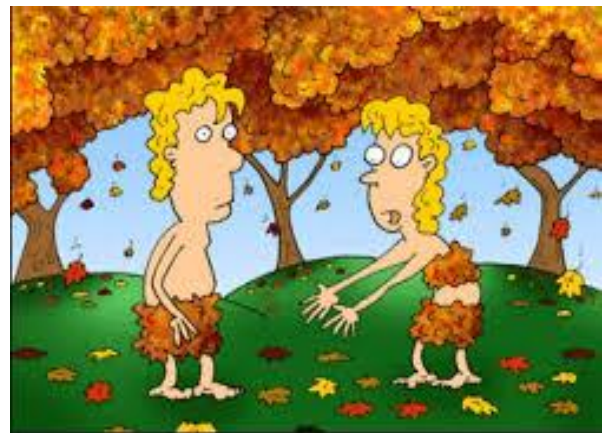
WILL YOU PLEASE PICK UP ALL YOUR CLOTHES?

Thank you! Your stewardship and generosity toward your parish is greatly needed and appreciated. Last week's Diocesan Collections mounted to $775.60 which is sent directly to the Diocese of Scranton.