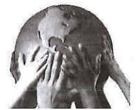
World Mission Day