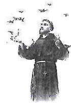
St. Francis de Sales