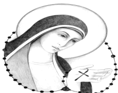
October 14th Blessed Virgin Mary