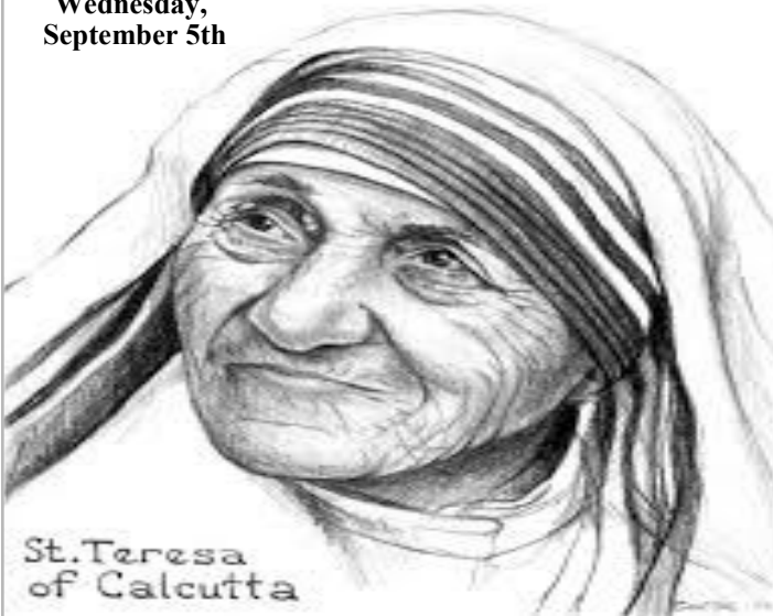
St. Teresa of Calcutta