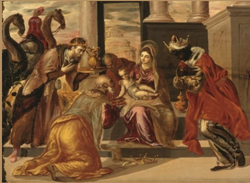
Adoration of the Magi by El Greco, 1568

Here is what the Catechism has to say about the feast that we celebrate this weekend: