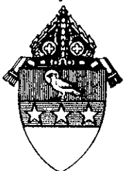
Diocese of Nashville