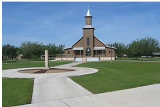
Spiritual Renewal Center Chapel

Personal Needs: Each person is challenged to review the decision-making process and to examine the motives for seeking marriage.