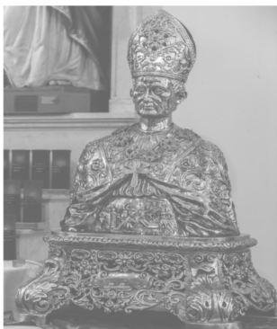
The Shrine Church of The Most Precious Blood is The National Shrine of San Gennaro

MOST PRECIOUS BLOOD SENIOR CLUB: Reminder – Because of the July 4th holiday being so close to the first Wednesday of the month, our senior club luncheon will take place on the second Wednesday in July which is July 12th. Please make a note of this change for July.