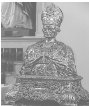
The Shrine Church of The Most Precious Blood is The National Shrine of San Gennaro

PRAYERS NEEDED. A parishioner with ties to a 5-year-old autistic boy is asking for prayers for him. He was found in the pool at a special needs camp; he had been in the water for at least 20 minutes and is currently on life-support. PLEASE PRAY FOR HIM. HE NEEDS A MIRACLE.