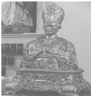
The Shrine Church of The Most Precious Blood is The National Shrine of San Gennaro

5:30PM (Vigil) For: In Honor of the Sacred Heart By: D. Aimone