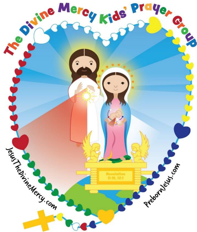
The Divine Mercy Kids' Prayer Group Happy Saints

Mary is the Mother of everyone. God wants His graces and mercy to flow through His dearly beloved Son, Jesus, and through His Mother, Mary, Ark of The New Covenant, to the whole world.