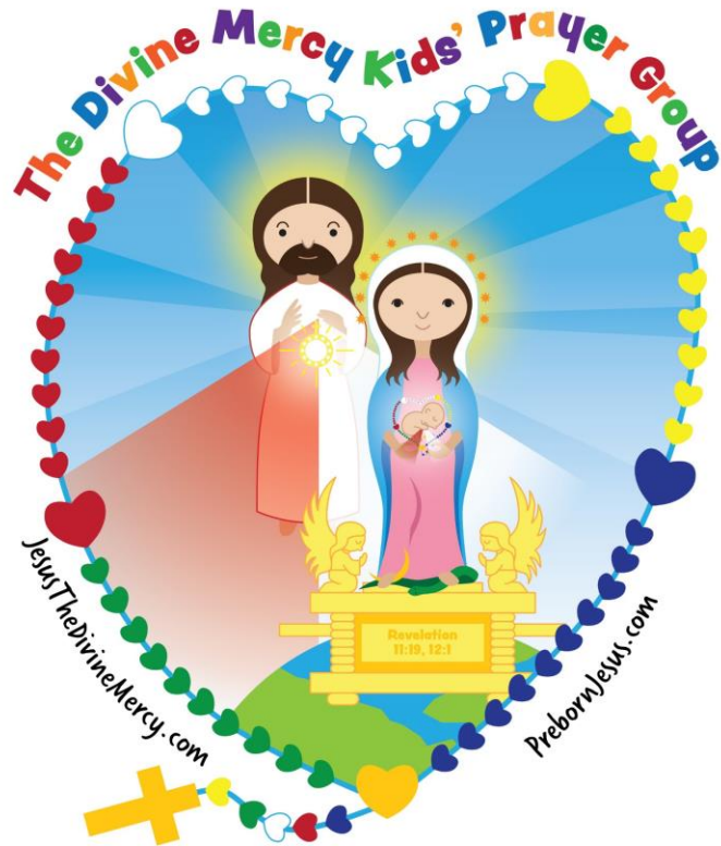
The Divine Mercy Kids' Prayer Group Happy Saints

Mary is the Mother of everyone. God wants His graces and mercy to flow through His dearly beloved Son, Jesus, and through His Mother, Mary, Ark of The New Covenant, to the whole world.