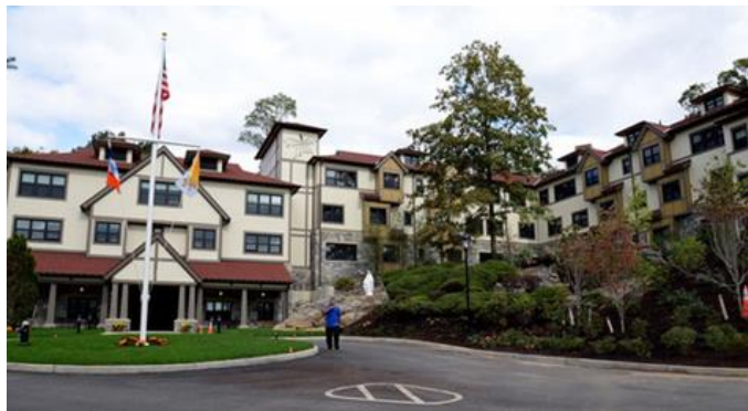
Visits may also be appreciated at the Pavilion!