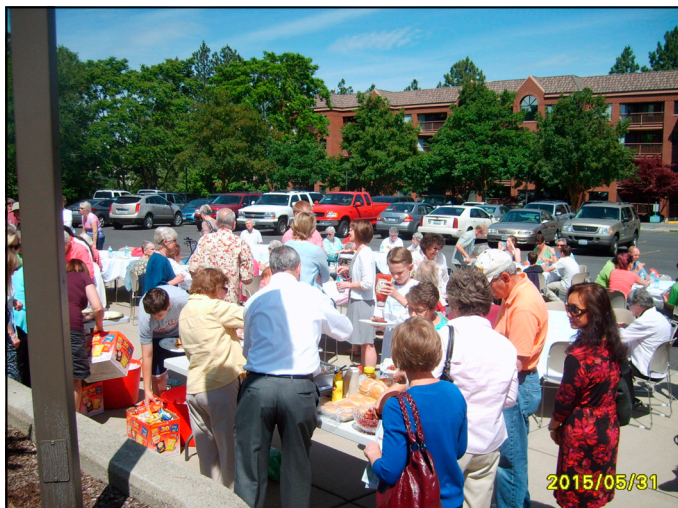
Parishioners gather after Mass on May 31 for the annual barbecue and volunteer appreciation event. The Servants of Sacred Heart live their faith through worship, growth in faith, service to our community and fostering the community of Sacred Heart.

The bishops' stewardship pastoral asks, "And what do Christians bring to the Eucharistic celebration and join there with Jesus' offering?" The answer: "Their lives as Christian disciples; their personal vocations and the stewardship they have exercised regarding them; their individual contributions to the great work of restoring all things in Christ."