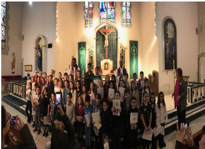
Our Lady Queen of Peace First Penance Prayer Service – January 19 th , 2019