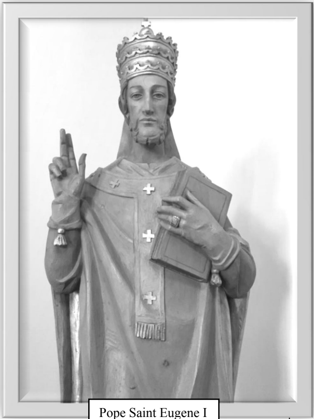
Pope Saint Eugene I